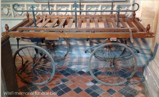
WWI memorial funeral bier