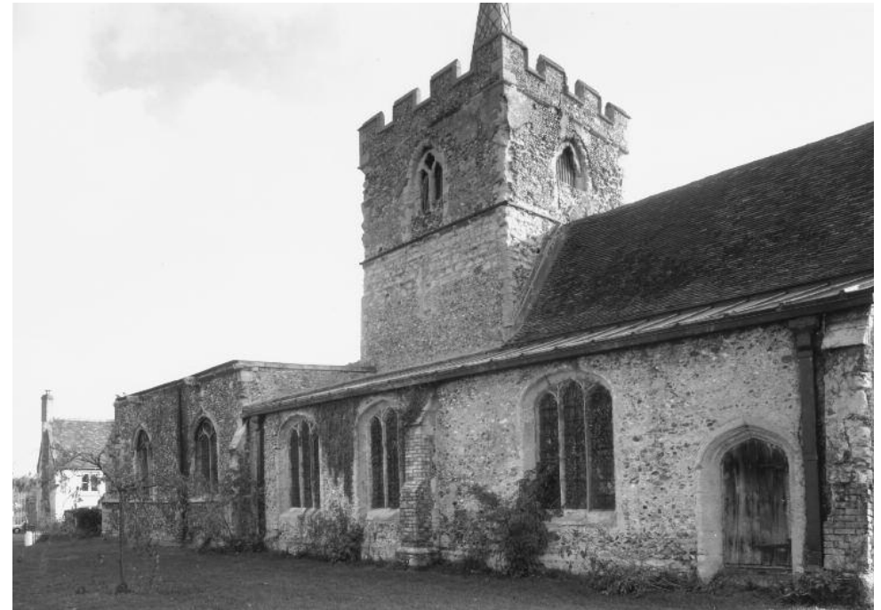
The north aisle and chapel

The east wall of the chancel was partly renewed with brick during the 17th or early 18th century and its four-light east window replaced three 13th-century single-lancet windows. Remains of the former northern lancet may be seen, and also traces of the original northern roof ridge. The south side has a two-light 14th-century window, and also a 13th-century lancet window, its lower division forming a 'low-side' window, through which a sanctus bell may have been rung to announce the climax of the Mass to the people unable to