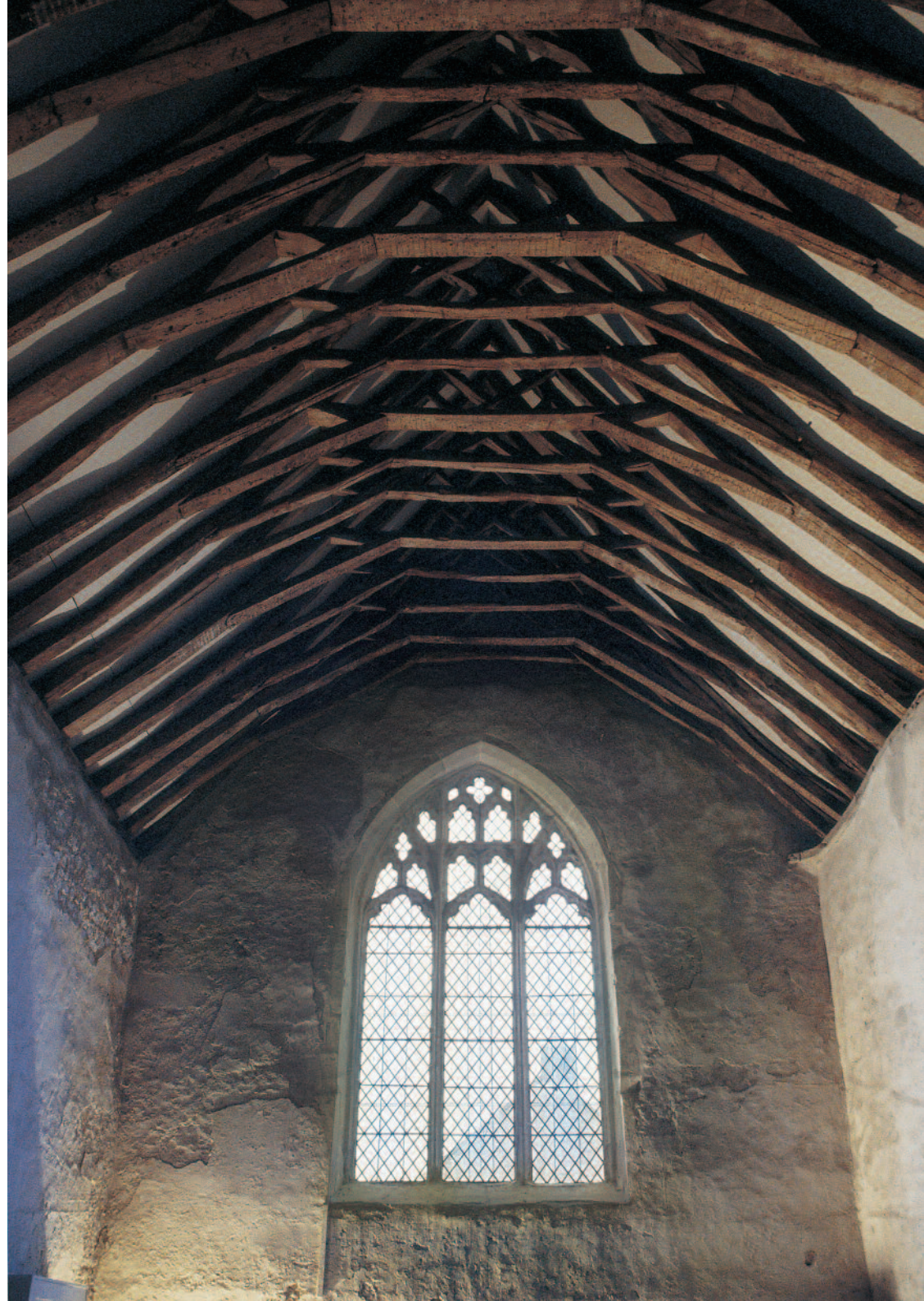
The nave roof and west window (Boris Baggs)

The roofs of St John’s retain much of their mediaeval timber work. The nave has a simple scissor beam roof, probably 14th century or earlier, and the lean-to roof of the aisle comprises mostly 15th-century work. The craftsmanship of the 15th-century roof is of high quality and in an excellent state of preservation. It is an arch-braced, cambered tie beam roof, with carved central bosses, showing leaves and foliage.