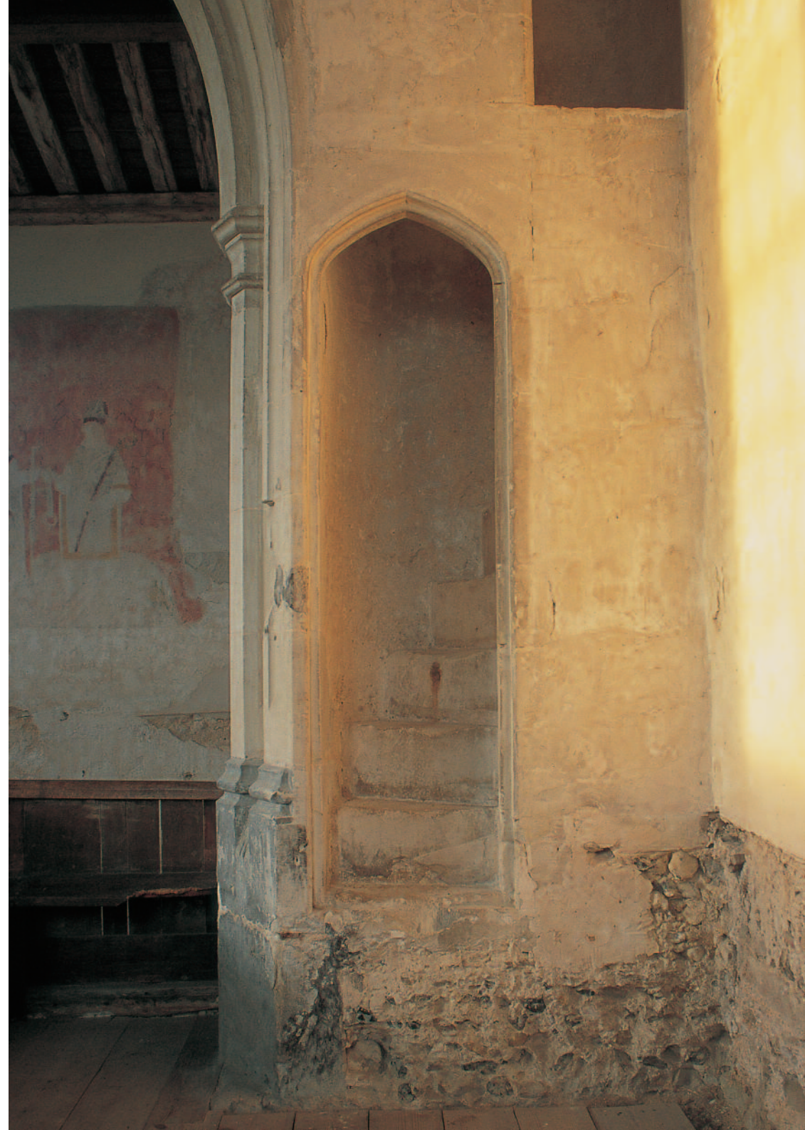
Right: Rood loft staircase (Boris Baggs)