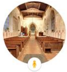
All Saints' Church, Cambridge