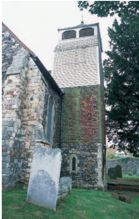
Left: Flint, brick and timber in the south porch tower (Boris Baggs)

The west front demonstrates the great width of the church. The three west windows received new tracery in 1869, but the finial above the central window is 14th-century stonework. Here are the blocked west doorway, and also the remains of Norman work in the little semicircle containing a piece of carved stone high up in the centre of the nave, and in what is now a niche beside the north aisle window. The west wall is faced with a variety of building materials, including sections of stone and flint. Similar areas of contrasting masonry may be seen in the north aisle wall. Its western section, including the 19th-century porch, is faced with knapped (split) flints, and the wall is strengthened by buttresses. Flanking the porch are a pair of two-light 14th-century windows with ogee curves and carved finials at the tops of their arches, and the original carved corbel heads upon which their hood moulds rest. Further east are two pairs of single lancet windows of 1874, but in the 13th-century Early English style; a further pair pierce the