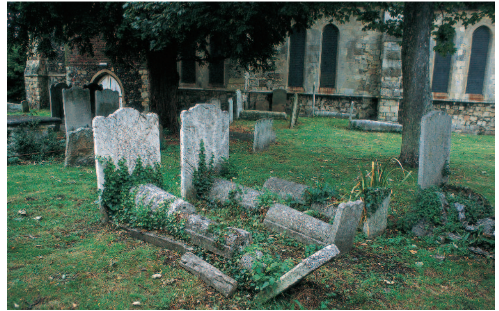
Graves in the quaint and secluded churchyard