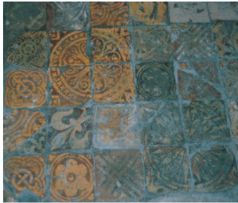
Right: Medieval encaustic tiles in the floor