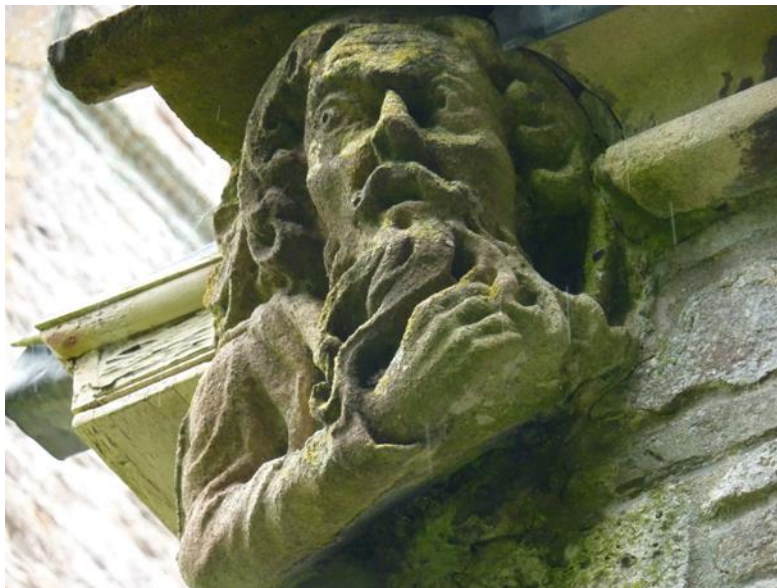
St Nicholas Church, Brockley, Somerset