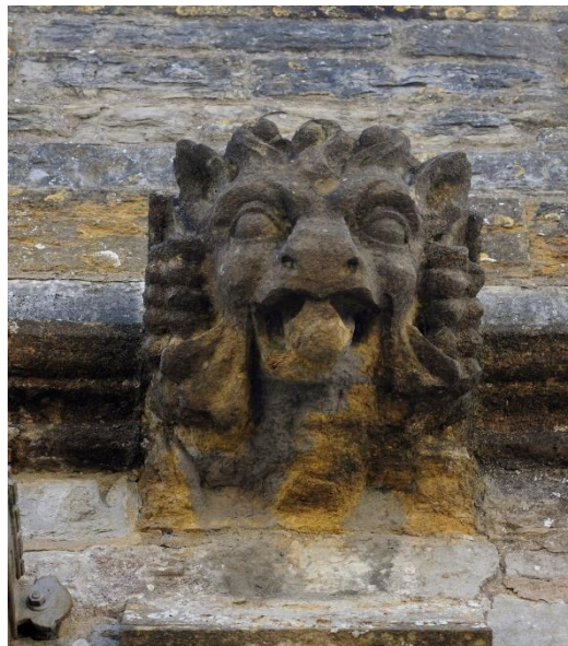
All Saints Church, Langport, Somerset