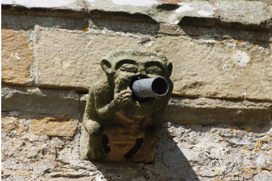
Holy Trinity Church, Wensley, North Yorkshire