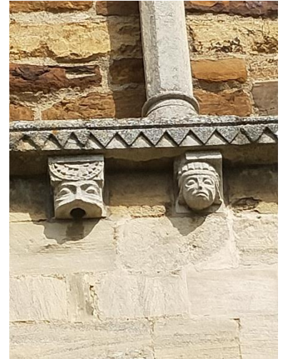
St Peter's Church, Marefair, Northampton