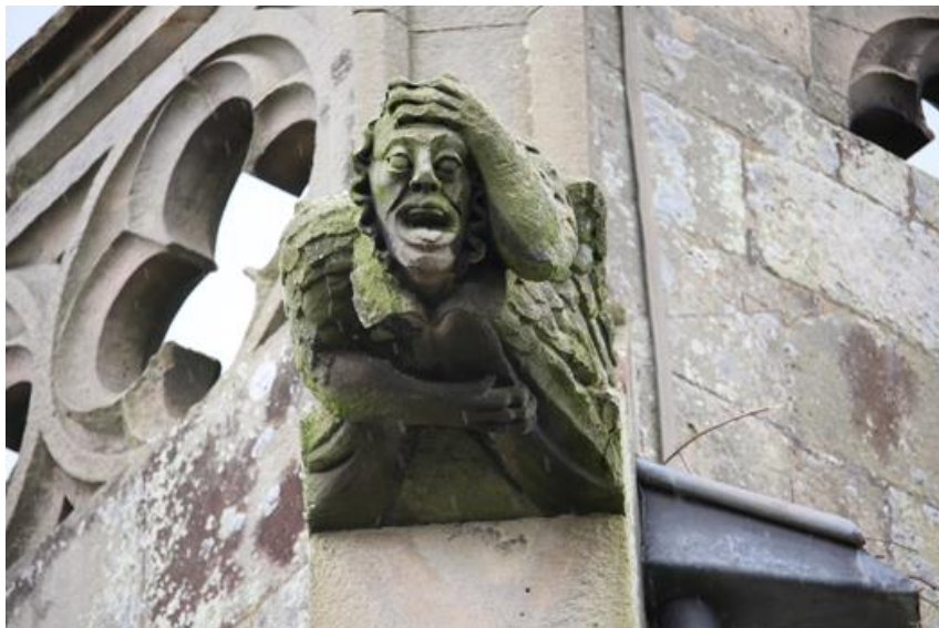
Church of St Mary Magdalene, Battlefield, Shropshire