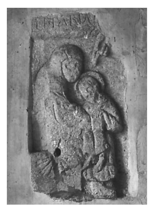
Carving of Mother and Child

ST JOHN THE BAPTIST'S CHURCH ST JOHN THE BAPTIST'S CHURCH