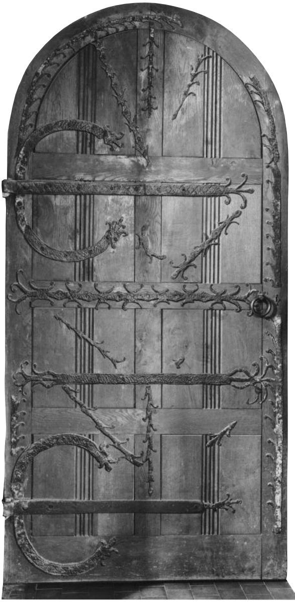
The north door, with its ironwork from the 12th century (BATSFORD)

Outside the church, at the south-west corner of the nave, is a plain limestone coffin-lid of the 12th century, which may possibly relate to one of the early priests of the church, or a member of the de Ispania family. This grave slab is of unusually simple design and was discovered buried in the churchyard c .1865; it was subsequently reburied and then rediscovered in 1989 during repair work on the church.