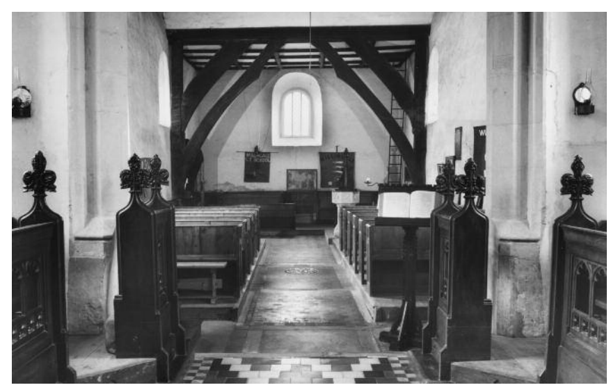
Interior looking west

The nave of St Andrew's is built largely of flint rubblework, with some courses of pudding-stone and quoins of Roman tile. Entry to the building is by a simple weatherboarded south porch which was probably constructed as part of the 1891–92 restoration of the church and extensively repaired a century later. The south doorway is 12th century and has a semicircular arch of reused Roman tiles; the door is modern. There are two small 12th century windows high in the north wall and opposite are windows of the 12th, 14th and 13th centuries going from west to east, the 14th century one having fine tracery. The 12th century north doorway leads to a small vestry built about 1891–92 and has a plain round-headed