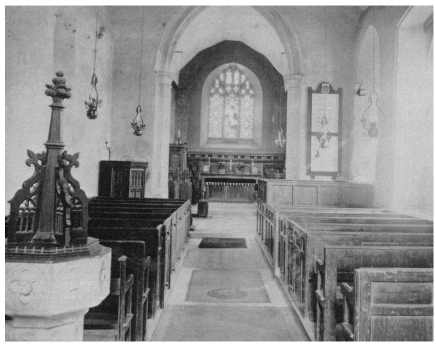
The interior before 1911, showing the former seating and large box-pew where the pulpit now stands

The chancel, with its handsome arch, dates from the 15th century and probably replaced a smaller 12th century chancel. Its length is approximately 24 feet (7.3 m), whilst the nave is 42½ feet (12.9 m) long. The 15th century rebuilding may have been a result of the generosity of the lord of Spains Hall or of the Augustinian monks of the nearby Blackmore priory, to whom the patronage of the church had reputedly been given in 1120 by William de Hispania, son or grandson of Hervey. The gift was in return for the foundation of a chantry in the priory where prayers would be said for the de Hispania family in perpetuity. The earliest known vicar of St Andrew's is