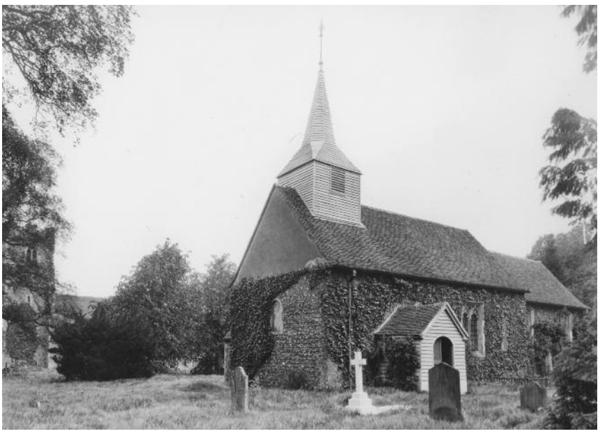
The two Willingale churches in 1919

Long before the Normans arrived in Essex, Willingale (the 'nook of Willa's people') was an Anglo-Saxon estate in the Roding valley at the southern extremity of the Dunmow hundred. The advent of the Normans caused it to be parcelled out to several manorial lords. Later, two parishes were formed: the larger became Willingale Doe and comprised the manors of Wantons (now Wardens Hall) and Torrells Hall, and the smaller became Willingale Spain and comprised the manors of Spains Hall and Mynchyns (later Minsons).